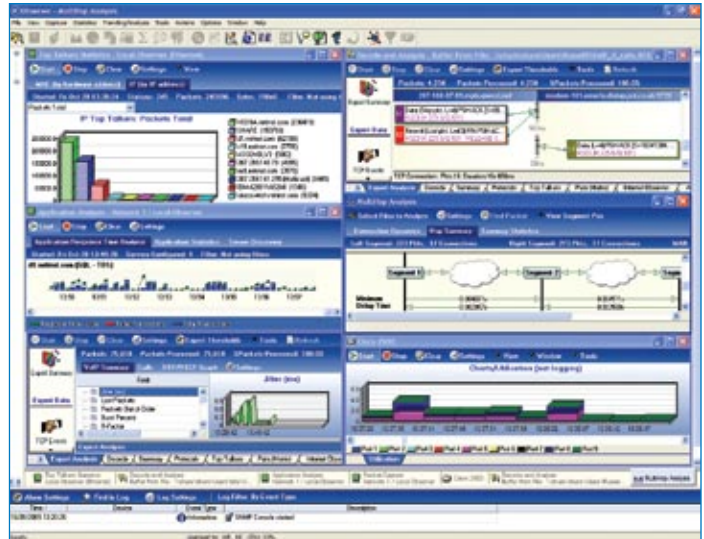
Observer Suite Main Console

Equipped with two gigabit fiber interfaces